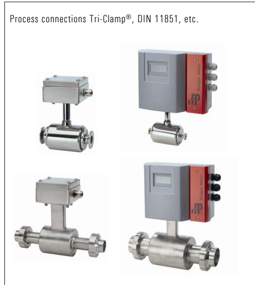
Process connections Tri-Clamp®, DIN 11851, etc.

The sanitary detector was developed for the flow measurement of liquid food. This model is available with Tri-Clamp®, DIN 11851 process connections and also with any special connections (customer specifications). The sanitary detector is delivered in a stainless steel housing and with PTFE lining.